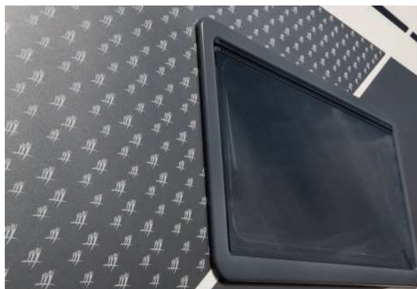
With RAPIDO logo pattern.