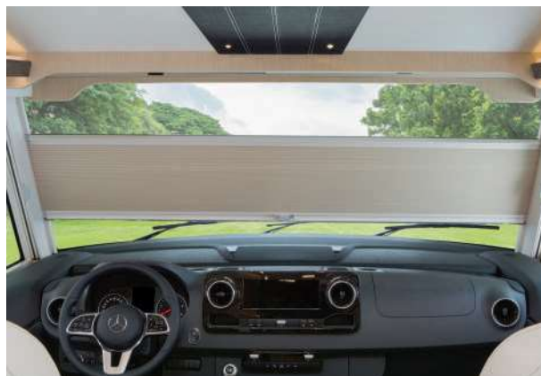
Down/up (privacy screen).