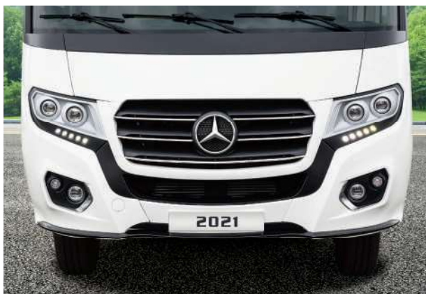
With LED day running lights and sporty grill.