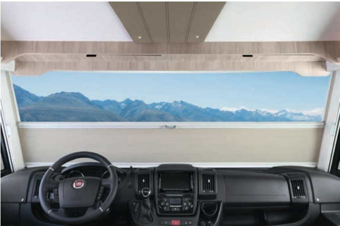
Down/up (privacy screen)