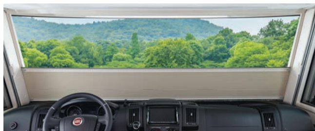
Down/up (privacy screen)